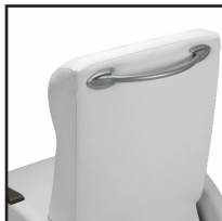
Push Bar IRC-A-PB-A