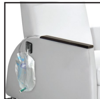
Drainage Bag Holder IRC-A-DB-A