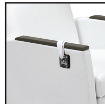
Restraint Strap Loop IRC-A-RS-A