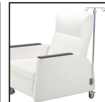
IV Pole and Holder IRC-A-IV-A