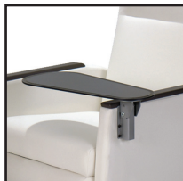
Self Storing Swivel Tablet IRC-A-ST-A