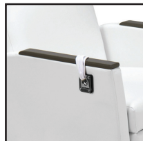
Restraint Strap Loop IRC-A-RS-A