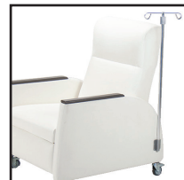
IV Pole and Holder IRC-A-IV-A