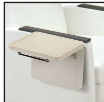
Folding Tablet IRC-A-FT-A