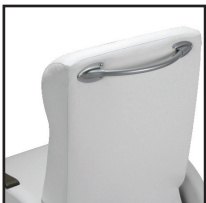
Push Bar IRC-A-PB-A