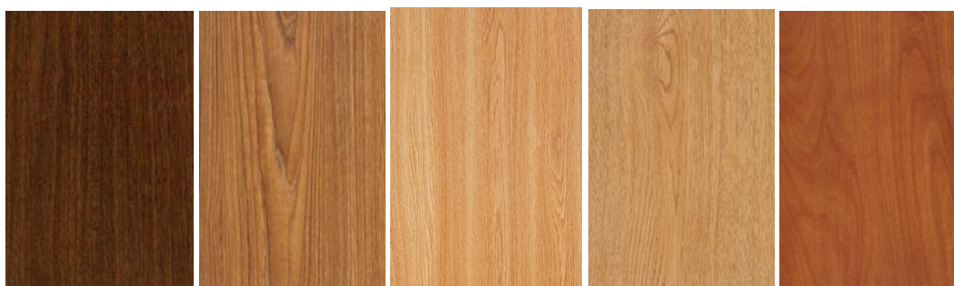
Gunstock Walnut (Standard)