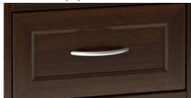
Shaker Silhouette (3)