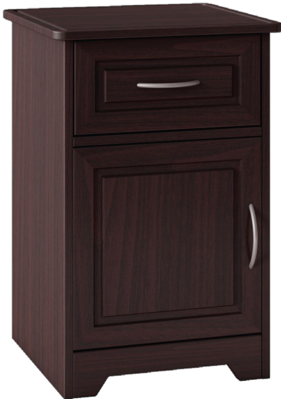
1-Door Bedside Table